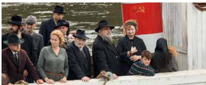
The Sign Painter