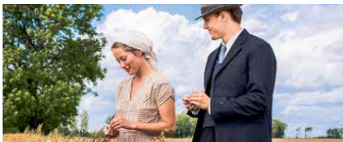
Where the Heart Is